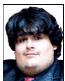
Slings and Arrows by Ian Grant