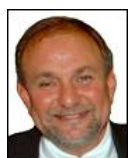
Letter From the Editor by Jim Theofelis

First and foremost I want to send a hearty "shout out" to the youth and alumni of foster care in Washington State who have worked so hard during this legislative session. It has been remarkable to watch young people from all corners of the state come to Olympia and advocate on critical proposed legislation. Examples of this critical legislation are HB 1961 Fostering Connections to Success and HB 1492 The Independent Youth Housing Program. Both of these provide critical housing for youth being discharged from Washington's foster care system. As many of you know, the statistics paint a very grim picture of what life is like for the 18 year-old that is discharged from foster care directly to the streets. The poor outcomes these youth face include homelessness, early parenting, increased chemical addiction and/or mental health problems and, of course, reliance on public assistance. Imagine being a child that was removed from your birth family and separated from your family, school, and community; endured being placed in multiple different foster homes and who knows what else during adolescence and yet still managed to earn a high school diploma or GED. As a reward for this incredible "against all odds" accomplishment, you find out that you have become immediately ineligible for foster care: you just lost your housing.